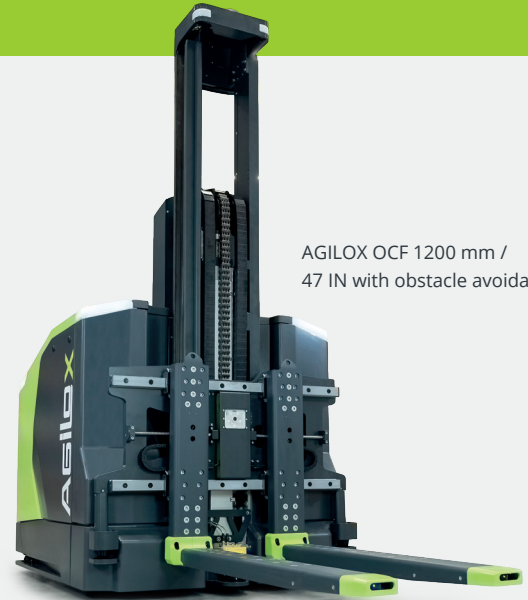
AGILOX OCF 1200 mm / 47 IN with obstacle avoidance

1,600 MM 1,500 KG 1.4 M/S 63 IN 3306 LBS max. speed max. lifting height max. lifting weight