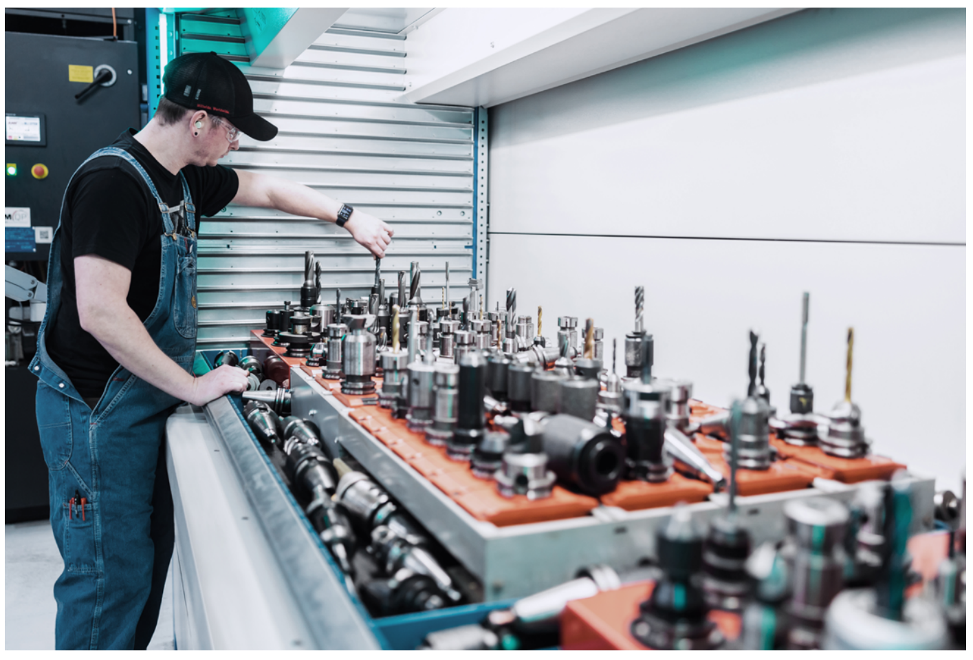
Tool storage with Kardex Shuttles

Further options and storage environments with air conditioning, clean room, fire protection or esd versions are available.