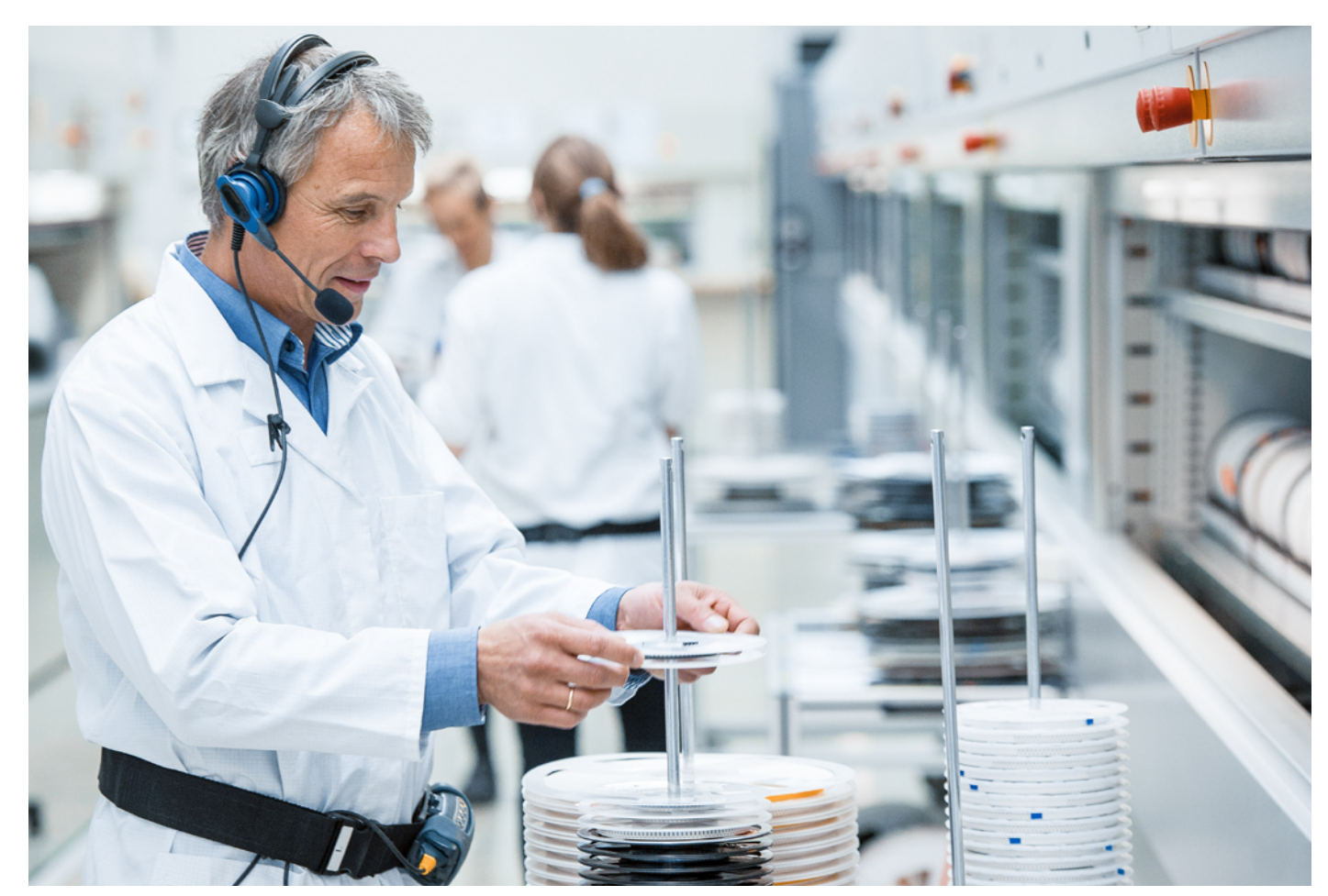
SMD handling with Kardex Megamats