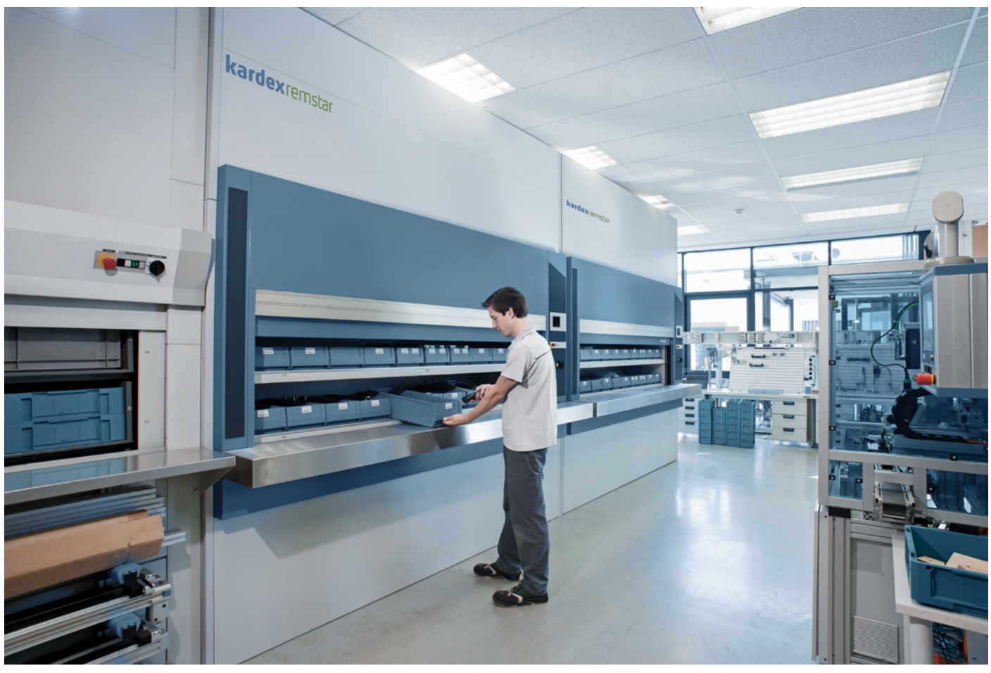
Spare parts management with Kardex Megamats

Further options and storage environments with air conditioning, clean room, fire protection or esd versions are available.